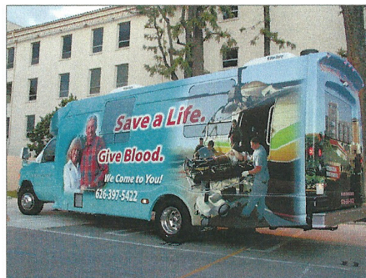
Custom graphics available.